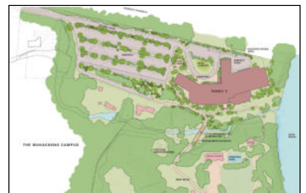
Aerial View of Site Plan (North is at Top)

Hardin made some educated guesses regarding the timing of events. He expects to be through the approval process by early 2007. After that, the next steps would be to complete fund-raising and break ground. At present, total costs associated with the new Family Y are estimated at $42 million. Construction is estimated to take about 18 months. Putting it all together, Hardin ballparked completion by late 2008 or early 2009.